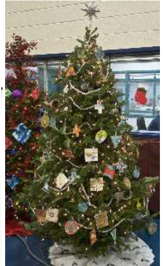
This year's tree