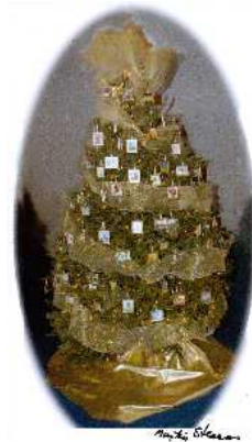
Our first tree in 2004