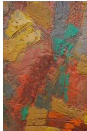
Detail of 18" x 18" encaustic painting "Veronese Green" by Dorothy Fetters